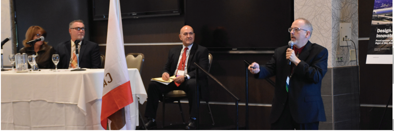
Discussing relocation, Photo Credit: Konstantin Akhrem