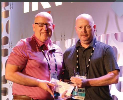
Carolinas, Chapter 31, Region 6 accepted the Gene L. Land Award for the Highest Numerical Gain.