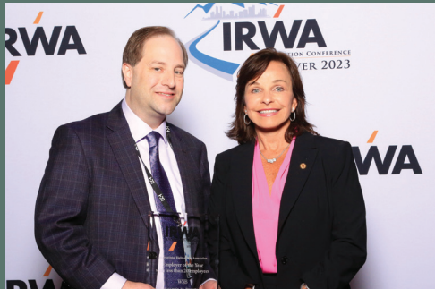
Employer of the Year with Less than 20 Employees was presented to WSB.