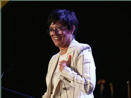
Employer of the Year with 20 employees or more was presented to HDR.