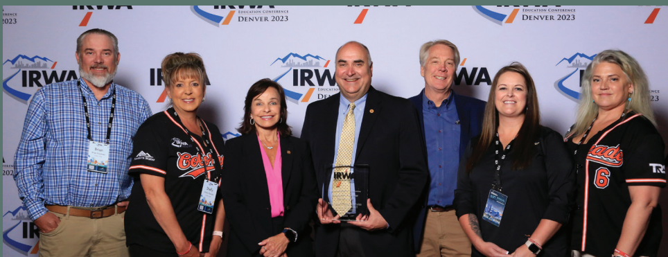
Northern Colorado Water Conservancy District was named Employer of the Year, Government Employer.