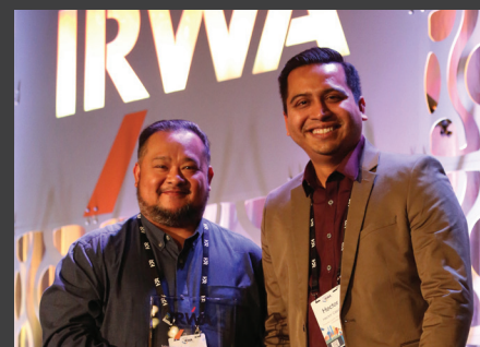
The recipient of the Website of Year award went to California Inland Empire, Chapter 57, Region 1.