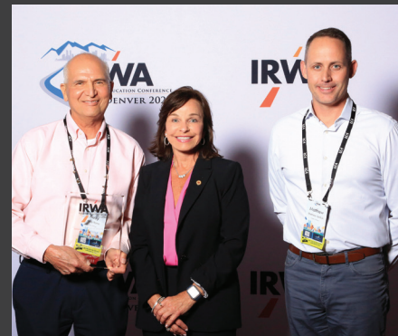
Newsletter of the Year was awarded to "Bundle of Writes," Chapter 67, Region 1.