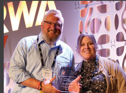
The Chapter of the Year Winner was Beaver State, Chapter 3, Region 7.