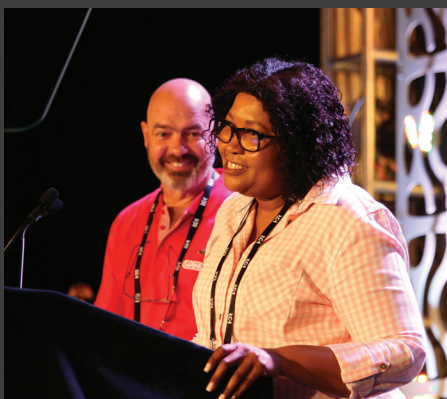
South Africa, Chapter 83, accepted the Gene L. Land Award for the Highest Percentage Gain.