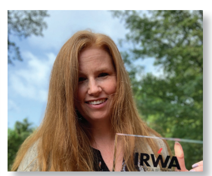
Employer of the Year with More than 20 employees was presented to NiSource, Inc.